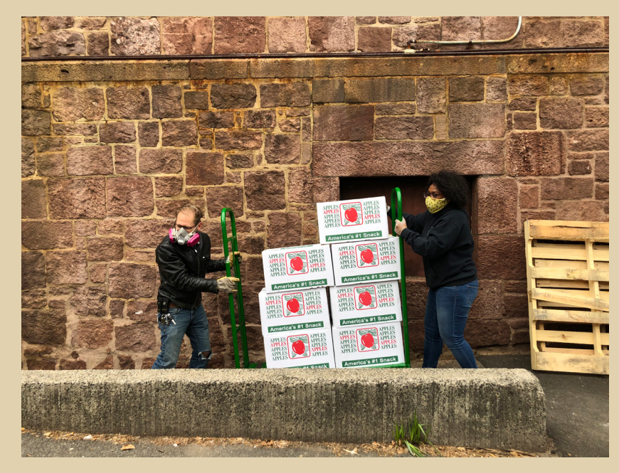
Response team volunteers delivering food prepared in bundles to seniors and those considered "at-risk" throughout several of our communities.

God has used this unexpected time to produce unprecedented health in our church ministries!